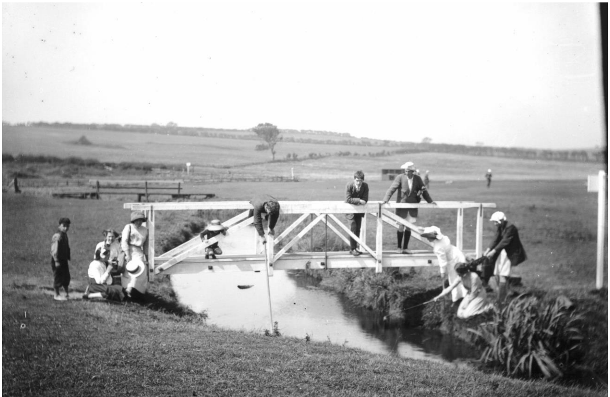
Photograph taken in 1911 by Lena Patterson of her family and friends playing golf at Embleton. View is North-west from what is now the 7 th fairway over Embleton burn in direction of where the clubhouse and carpark are now located.